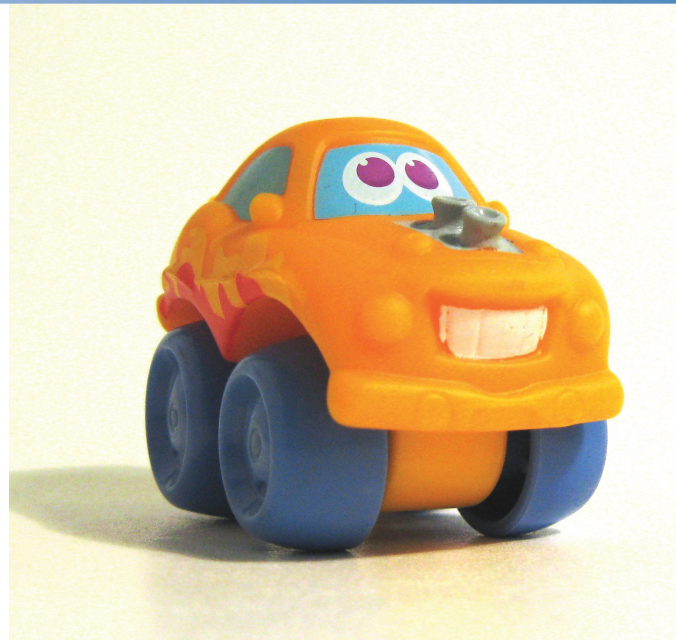
Table 1. Limits of element migration from toy materials according to EN 71-3:1994/AC:2002, ASTM F963-11 and ISO 8124:2010. All values are mg/kg in solution

The three most common test methods used are EN 71-3:1994/AC:2002 and ISO 8124:2010 “Safety of toys – Part 3: Migration of certain elements” and ASTM F963-11 “Standard Consumer Safety Specification for Toy Safety”. The maximum permissible concentration of the migrated elements is the same for these standards as shown in Table 1. These values are based on the bioavailability of the elements and the average quantities of toy components that are inadvertently consumed by a child on a daily basis (estimated at 8 mg per day).