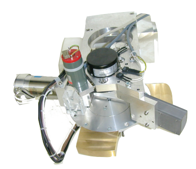
Figure 1. SmartGonio

analysis time or improve sensitivity. As an added advantage, ARL OPTIM'X does not require the same auxiliary water cooling as higher-powered wavelength dispersive systems despite providing similar performance.